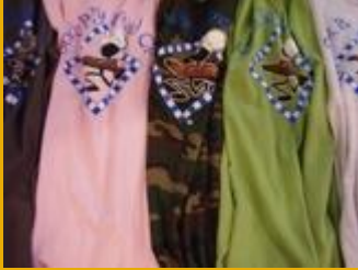
T-Shirts **check out the new tie-dye t's prices vary