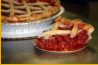
Cherry Pie $15.99