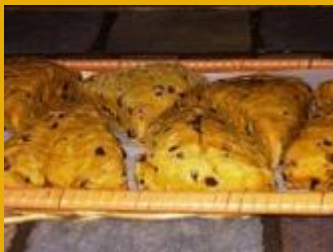
Pumpkin Chocolate Chip Scones $1.70