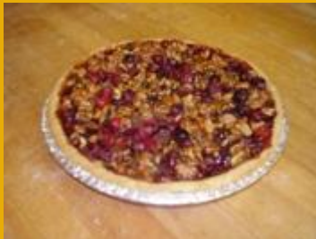
Cranberry Walnut Pie $1.599