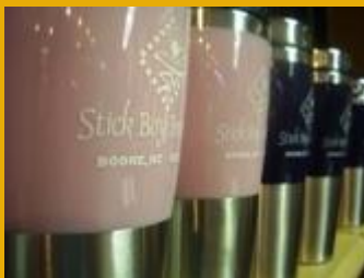
Travel Mugs prices vary